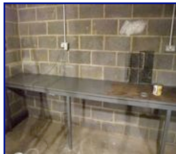
New benches for workspace