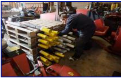
Newly painted Hazard Stakes